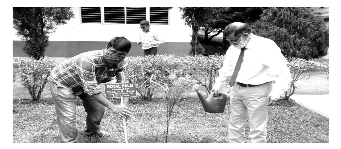
Plantation in front of Cafeteria on the occasion of World Environment Day, 2020

A total of 571 plant saplings of different species (like ornamental plants/shrubs, fruit trees and medicinal plants etc.) were planted in different parts of the University campus, which include the Tezpur University Botanical Garden, Cafeteria, Guest House, Auditorium, Additional plot, School of Engineering, School of Management Science, along roads of residential area and other locations, Citrus garden near Subansiri Women Hostel and Academic Building I, along the boundary wall etc. through routine and special plantation program organized by the Horticulture Section, Tezpur University on various events/occasions with active participation from university communities.