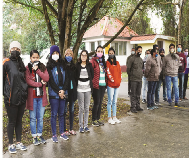
28th Foundation Day