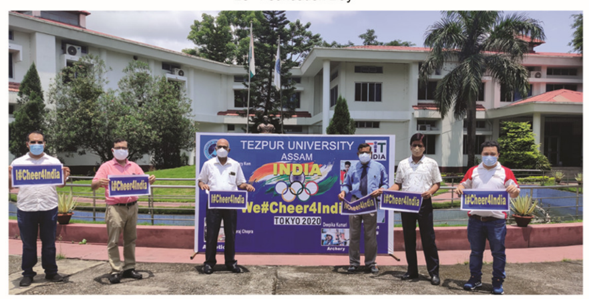
Cheer for India