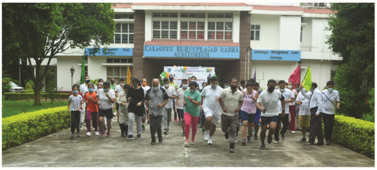
Fit India Freedom Run