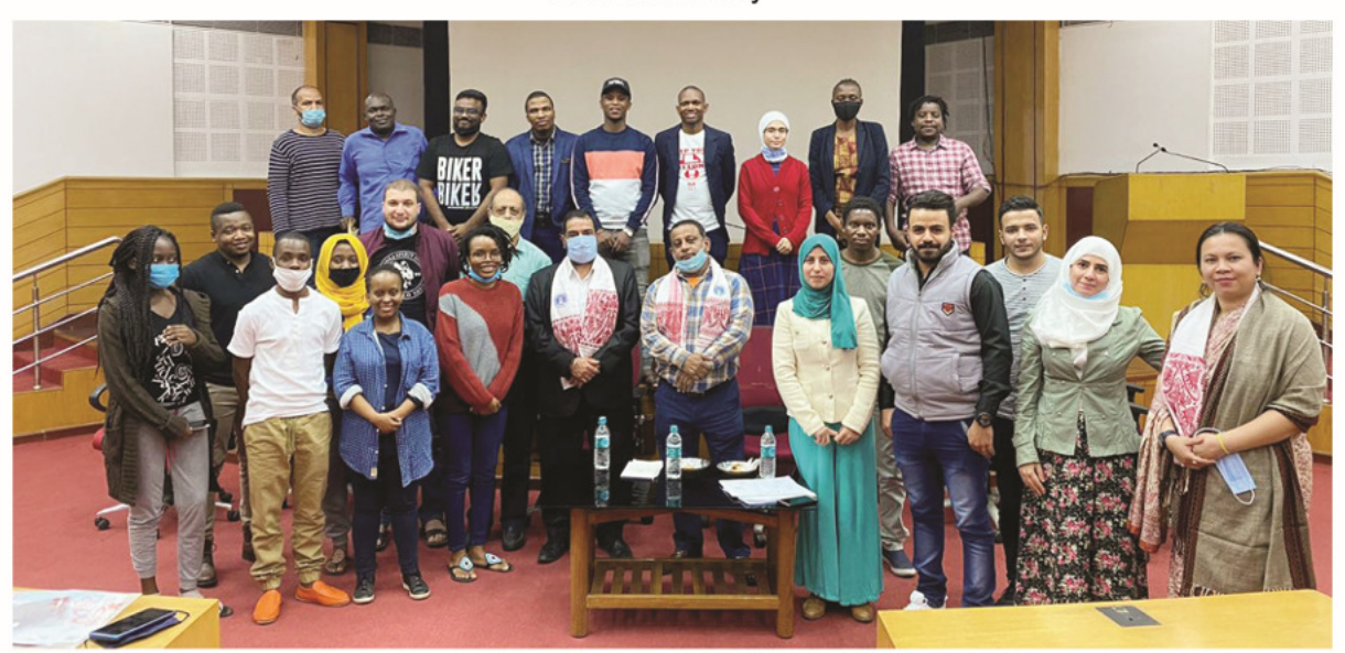
ICCR Delegation Tezpur University