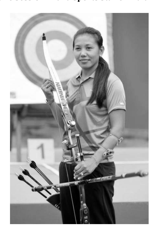
"Interactive Session with a Sports Star of India" Episode #01

Interactive session with star of India. Episode 01 was organized with Laishram Bombayla Devi Padma Shri, Arjun awardee & Olympian. A large number of students have participated.