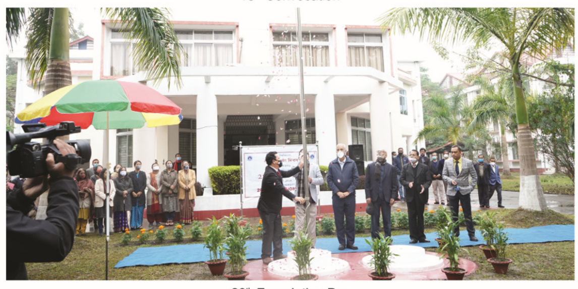
28th Foundation Day