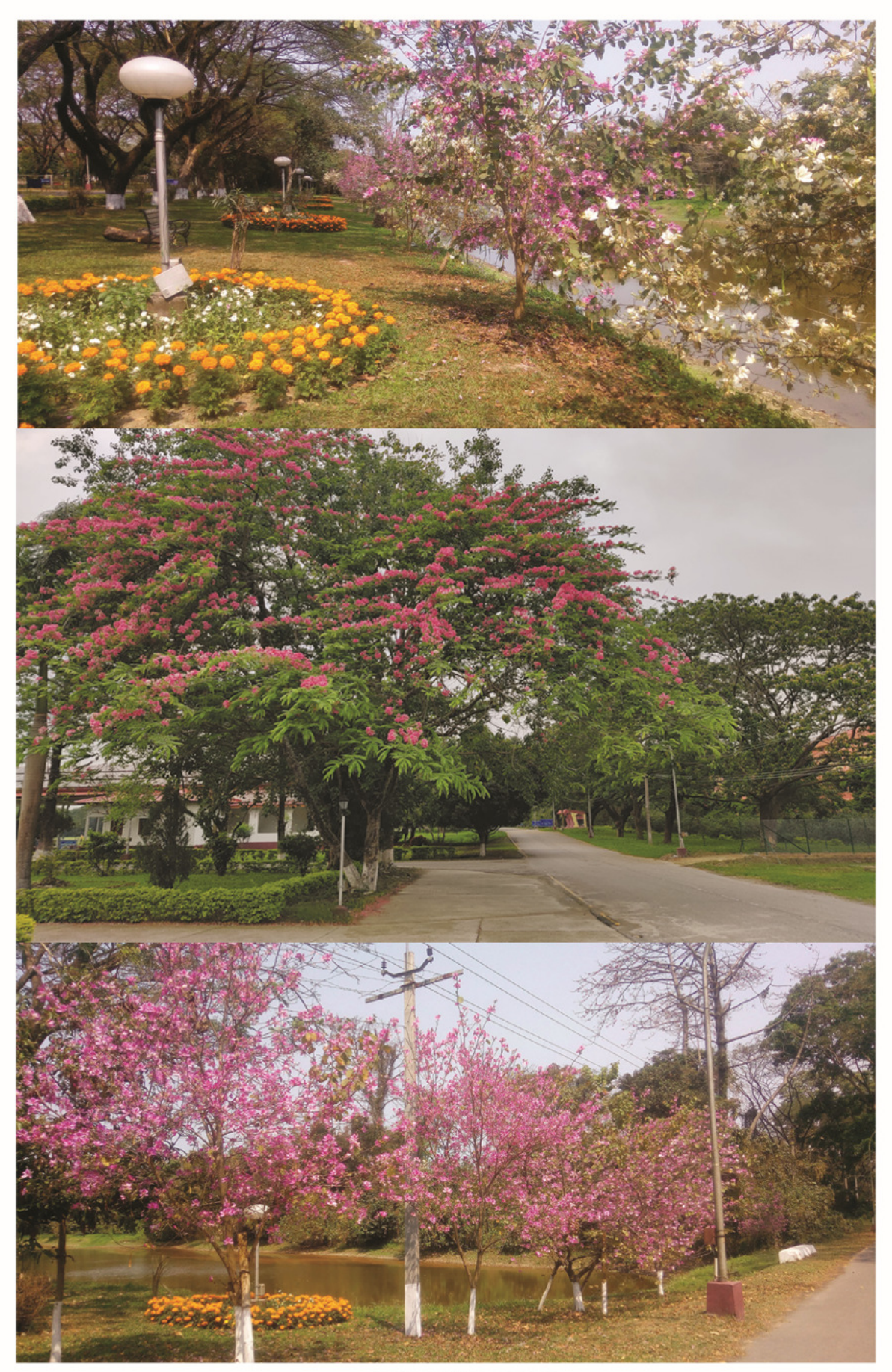
A view of the campus