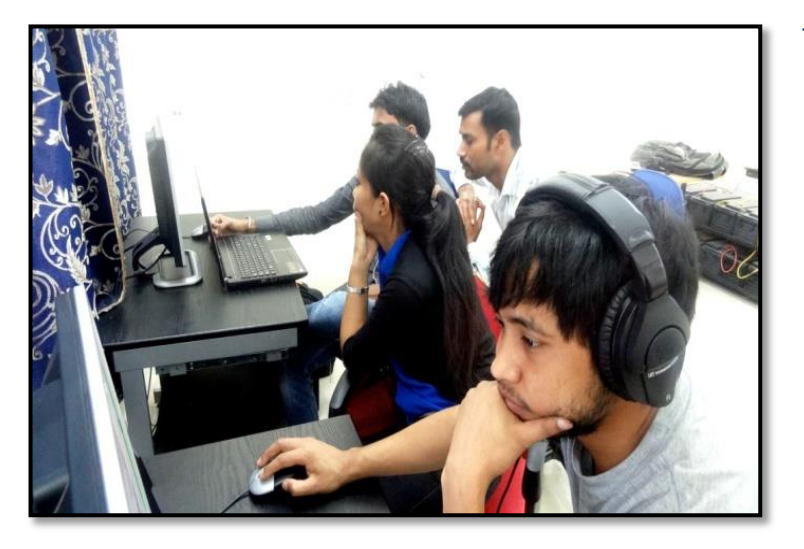
That day they were supposed to edit their work after coming from the field and then disseminate their productions in the evening. Accordingly, after returning from the field all the participants

On the third day of the workshop, during the first session, the groups who could not finish their recording the previous day, once again went to the Noonbari Tea Estate to meet the community folks. And those who had completed their recording the previous day started editing those productions