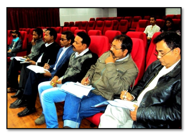
Participants attending the mock press conference

north-east region, Tezpur University had