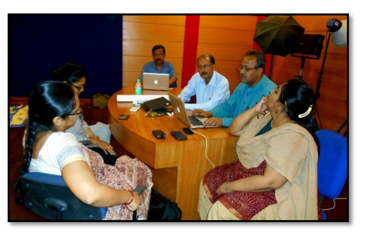
Resource persons and co-ordinators pegging away towards devising the capacity building modules

objectives, the course structure, the tools to be