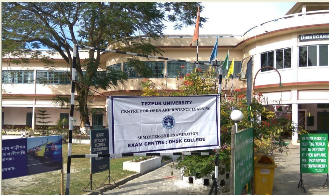
Study Centre of CDOE at DHSK College, Dibrugarh