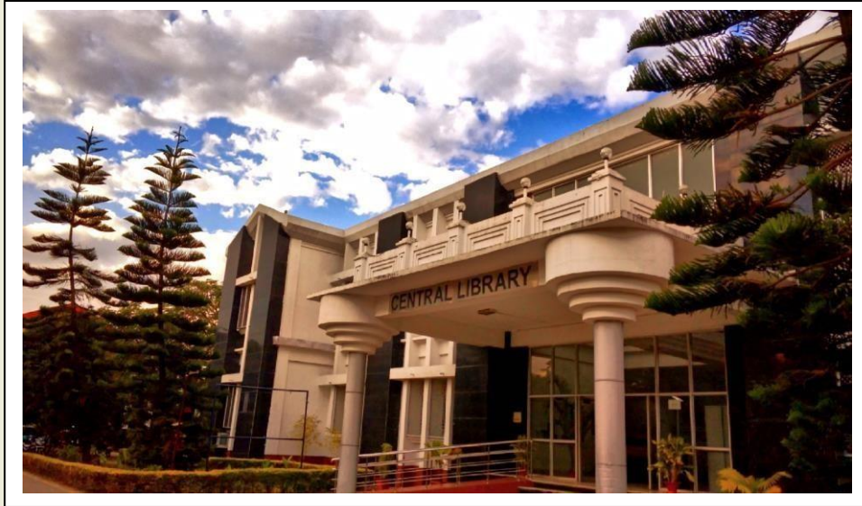
CENTRAL LIBRARY, TEZPUR UNIVERSITY