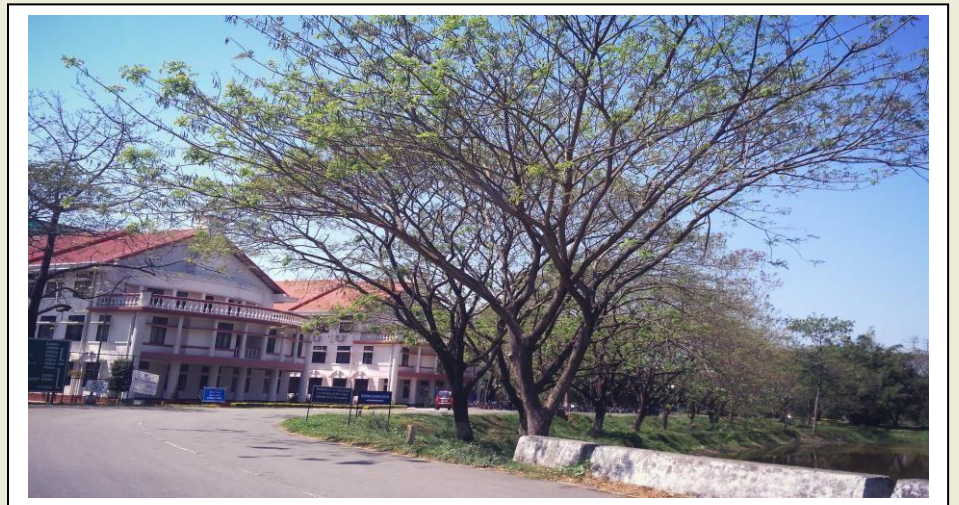
SCHOOL OF HUMANITIES AND SOCIAL SCIENCES, TEZPUR UNIVERSITY