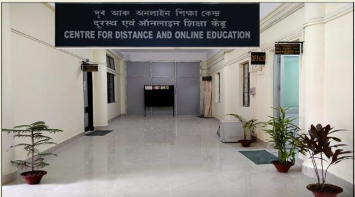
Inside view of CDOE premises