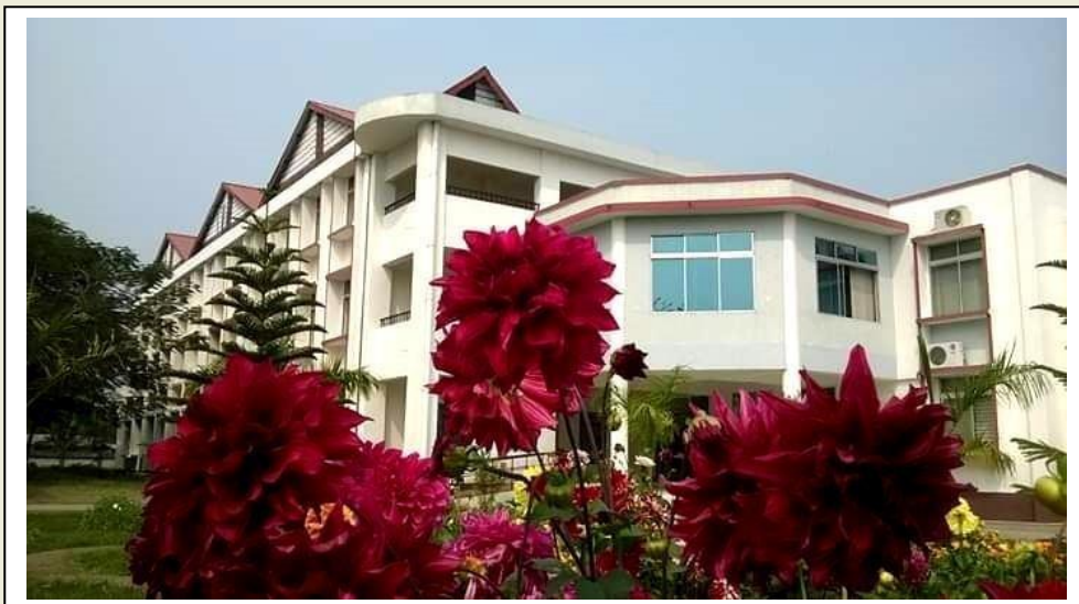
SCHOOL OF ENGINEERING, TEZPUR UNIVERSITY