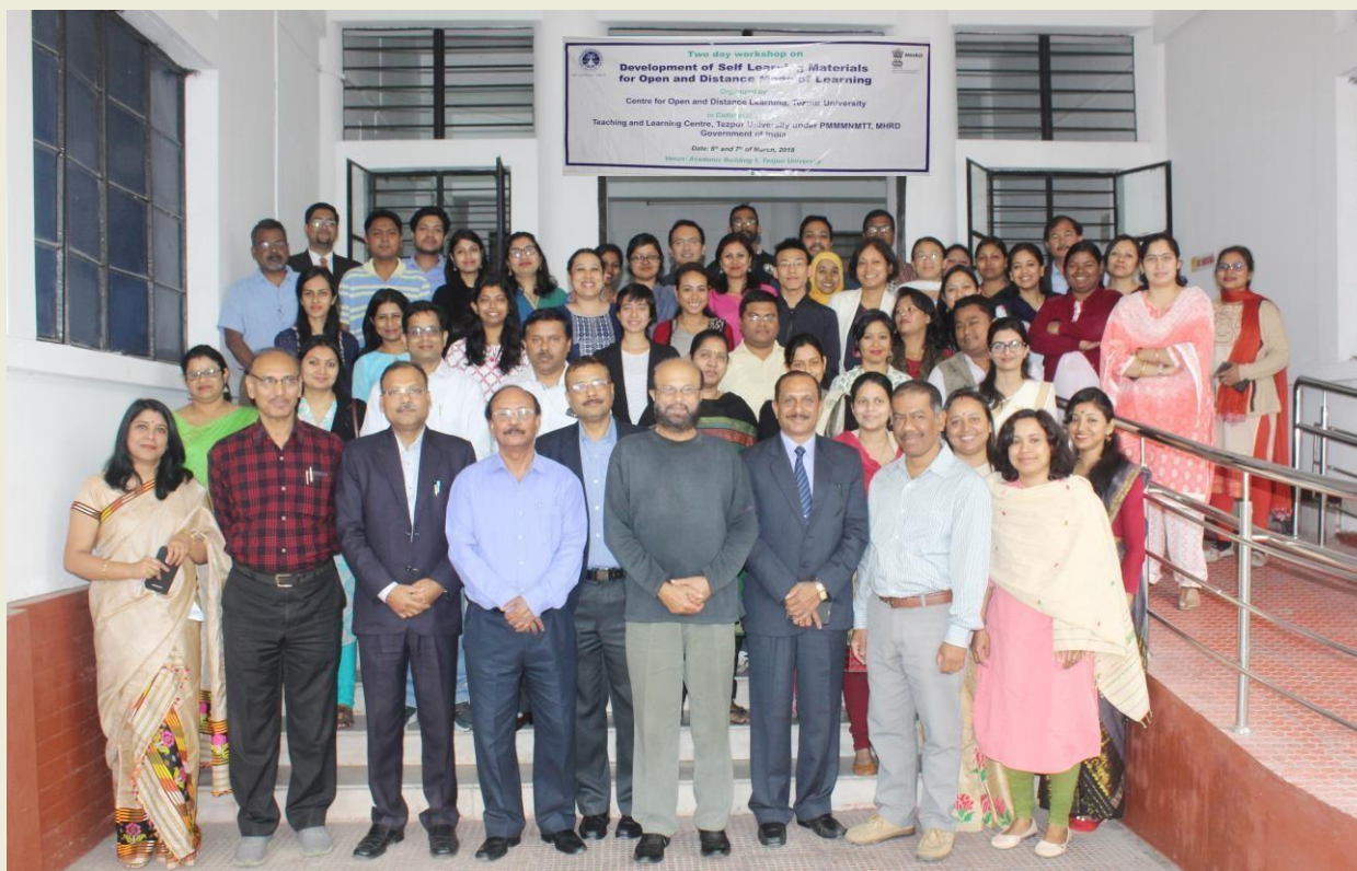
Dignitaries, Resource Persons, Guests and Participants of the two day workshop on Development of Self Learning Materials organized by CDOE in collaboration with Teaching Learning Centre, Tezpur University on 6 th and 7 th of March, 2019.